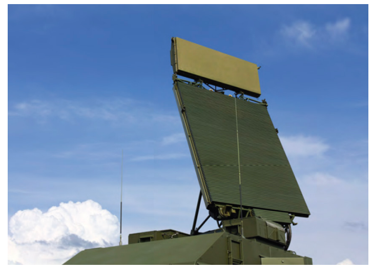
All-around antenna. Phased array technology.

30 GHz performance and beyond in a 30x60 (0.89x1.65mm) package.