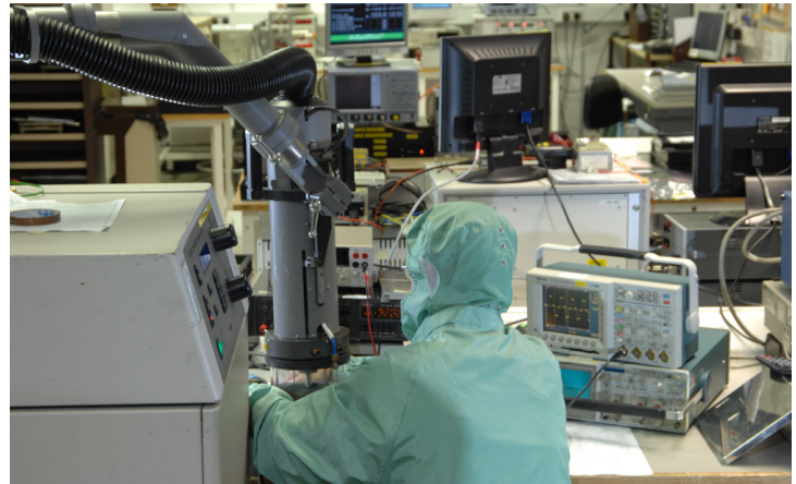
AS9100 & MIL-PRF-38534 (Classes H and K) certified facilities

Spectrum Control can assist with concept design and component selection, through to assembly & testing.