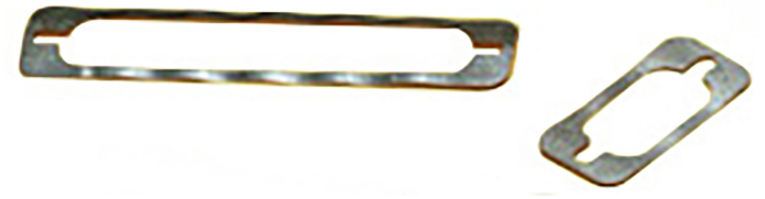
Waved Metal Grounding/Shielding Gasket (shown in free state)

Proper mounting of an EMI filter is critical to achieving optimum filtering performance. For applications requiring very high attenuation, it is necessary to fill the gaps at the mounting surface-to-connector interface. The length of any gap must be short, relative to the wavelength of the signal to be attenuated. Spectrum Control supplies a line of "waved" gaskets. This design ensures the maximum "gap length" will not exceed the wave pitch, .200" (5.08mm), even on the surfaces with poor flatness. This ensures maximum filter performance to 1 GHz and beyond.